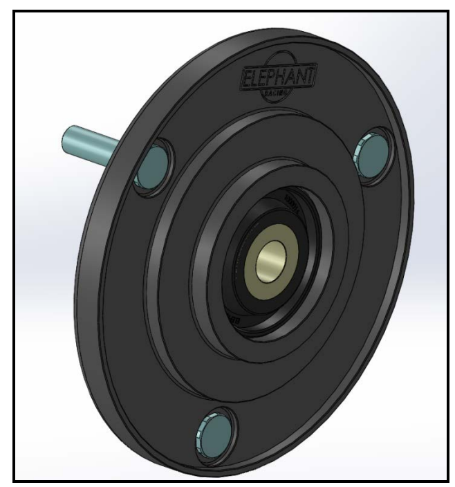
996 / 997 Rear Upper Shock Mount